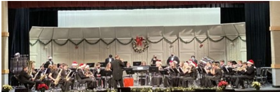
Masconomet Holiday Music Concert, December 2021