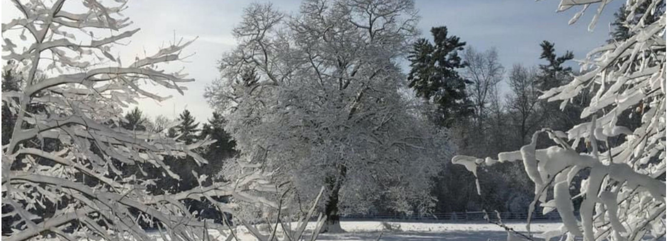
Snowy field on Main Street.