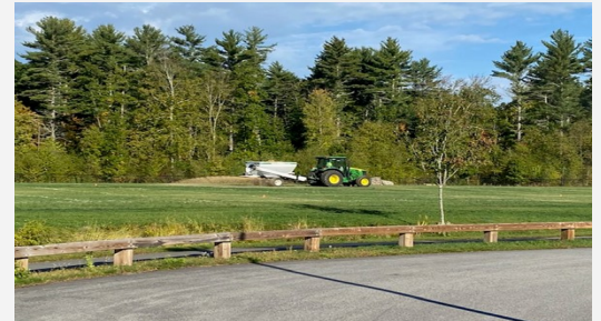
Top Dressing Machine at the Boxford Commons in October

Lastly, following the historic drought this summer, the DPW put significant resources into field maintenance and soil amendment. All of the Town's playing fields were core aerated and overseeded utilizing the town's new "Seedavator". Further, RAD Sports core aerated, top dressed, and slice seeded the natural fields at the Boxford Commons. We are confident that with adequate rain and well levels at their natural levels, the conditions of the fields will improve greatly next season with this work continuing.