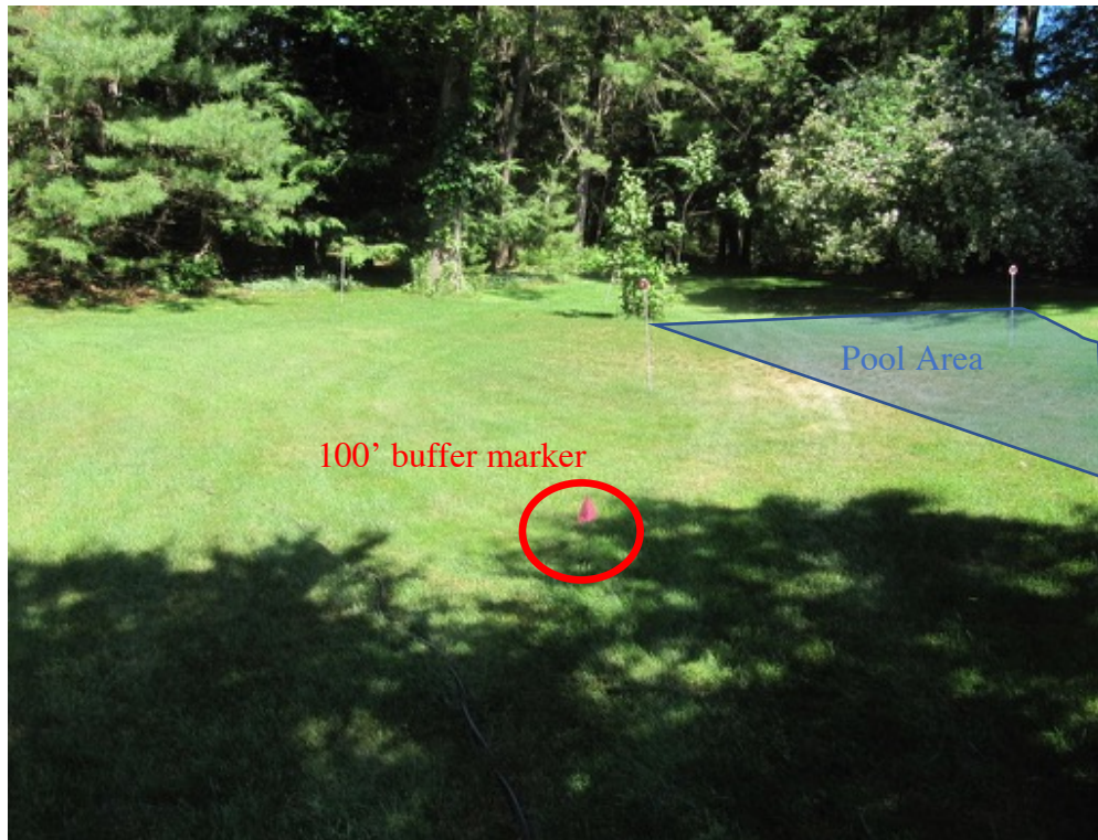
Photo B. 100 ft marker showing limit of 100' buffer zone. Photo by B. Prokop 06/19/20.