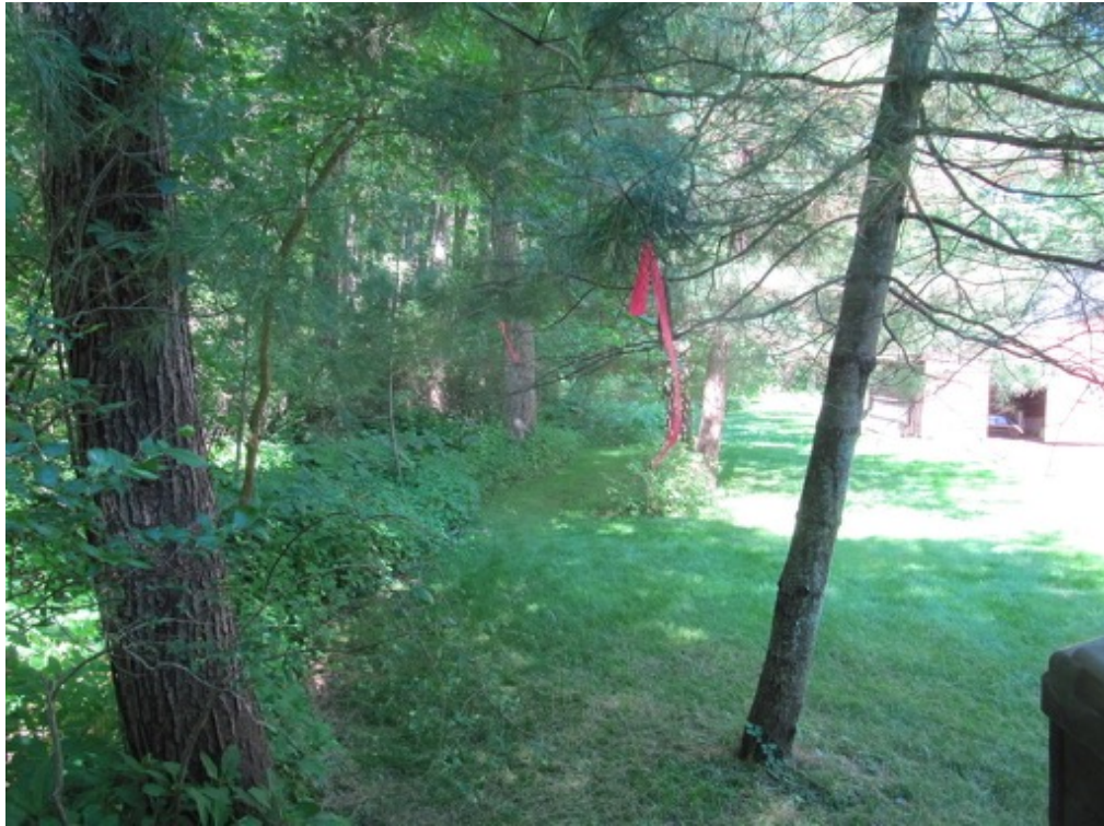
Photo A. Wetland delineation flag located just south of the driveway. Photo by B. Prokop 06/19/20.