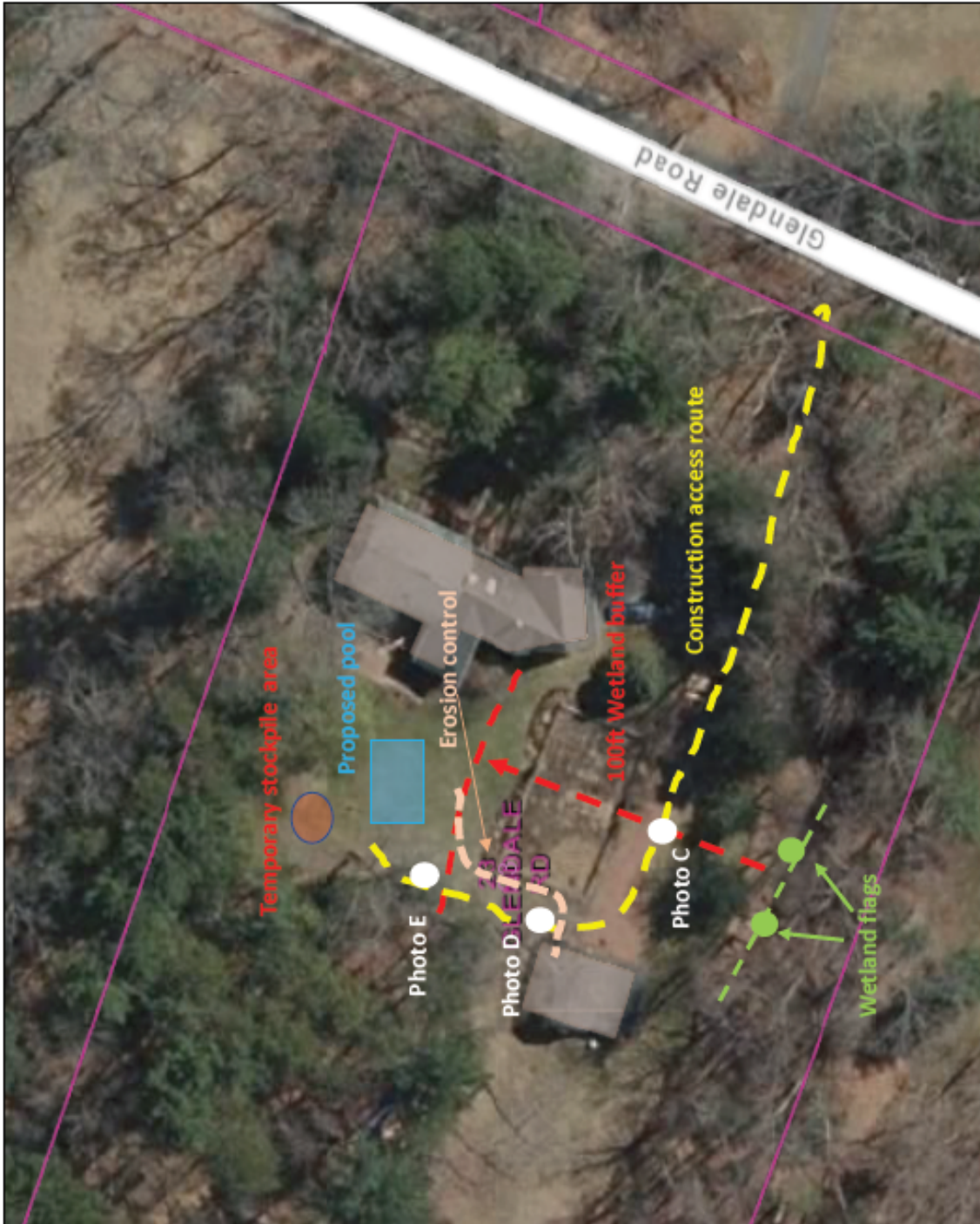
Figure 1. Sketch of wetland edge, buffer and pool. Sketch prepared by Bob Prokop 06/20/20.