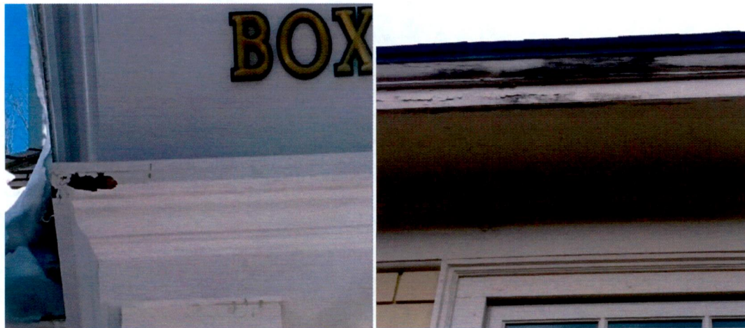
Photos below show rotting wood at roof of 188 Washington Street and broken weatherstrip at cellar entrance that allowed water into basement this January, and Lincoln Hall window sill.

Examples for this year include painting the molding roofline trim on Lincoln Hall (below right) & west fire station. Repair rotted molding on police station (below left) front portico that fell into Warren’s hand when he was putting up the Christmas lights.