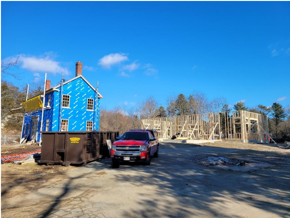
12. View of framing progress from southwest