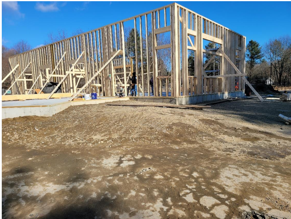
2. Exterior wall framing at Multipurpose/ Kitchen Wing