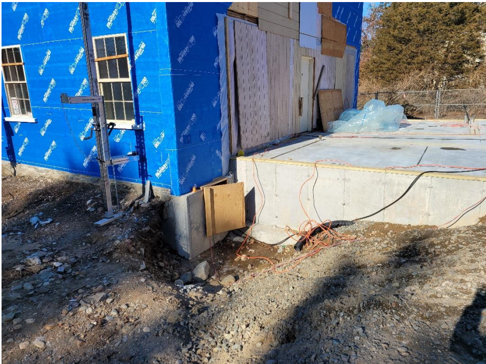
4. Tie-in to East Wall of Cummings House