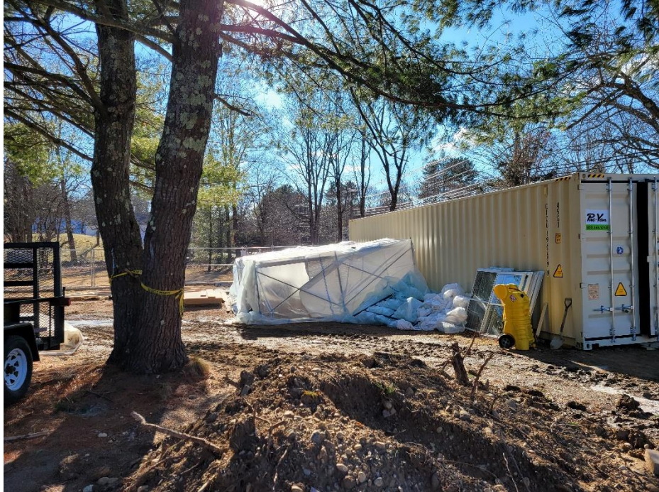
11. Temporary heated enclosure off storage unit