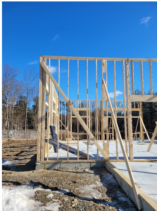
6. Northwest corner of Multipurpose Room