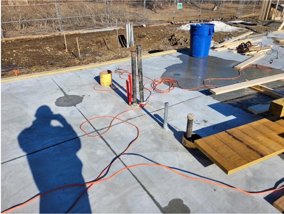
3. Plumbing at future toilet rooms