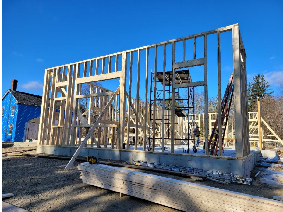
9. South wall of Kitchen