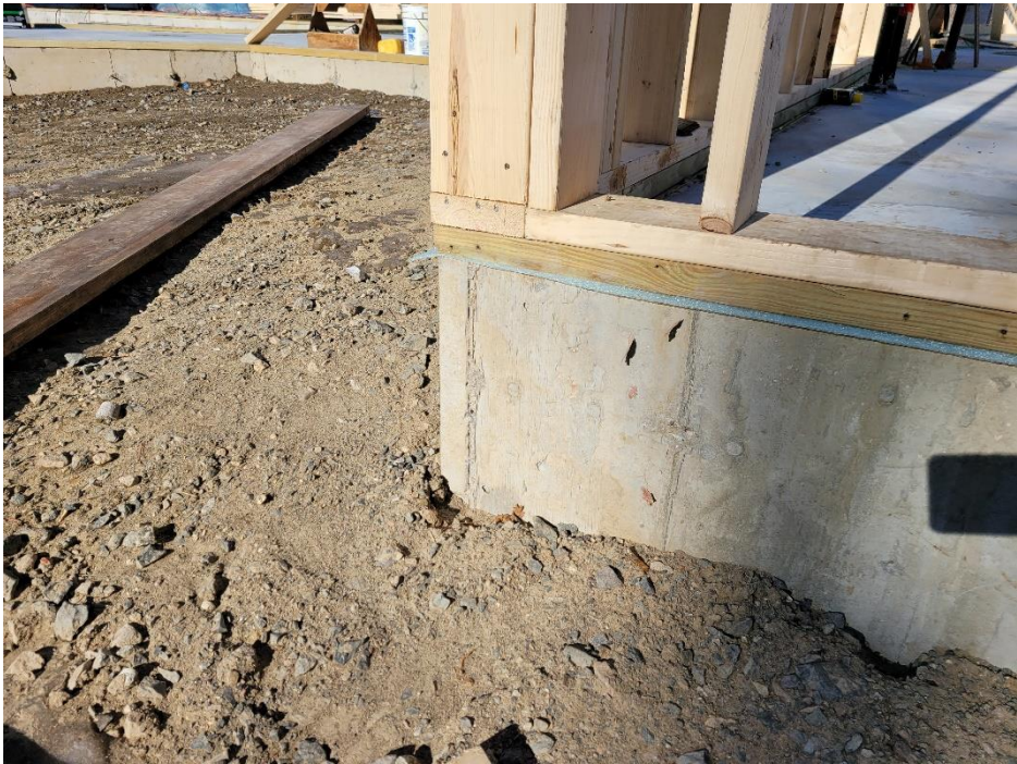
10. Sill detail- typical at perimeter of new addition