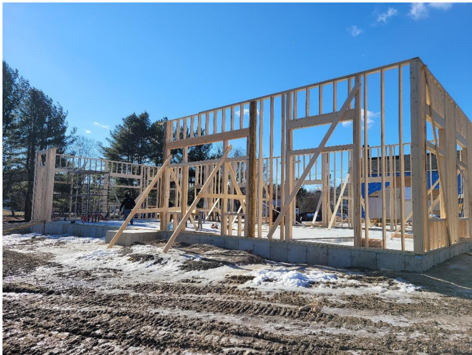
8. East Wall of Multipurpose/ Kitchen Wing