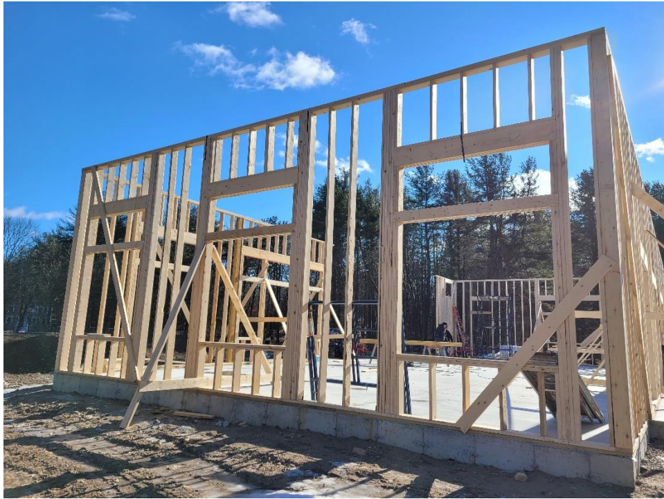
7. North wall of Multipurpose Room (14 feet high)