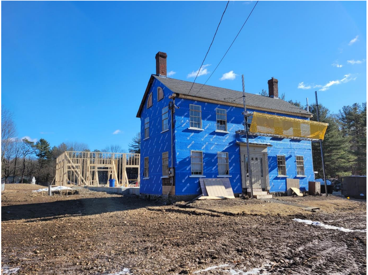
13. View from the northwest