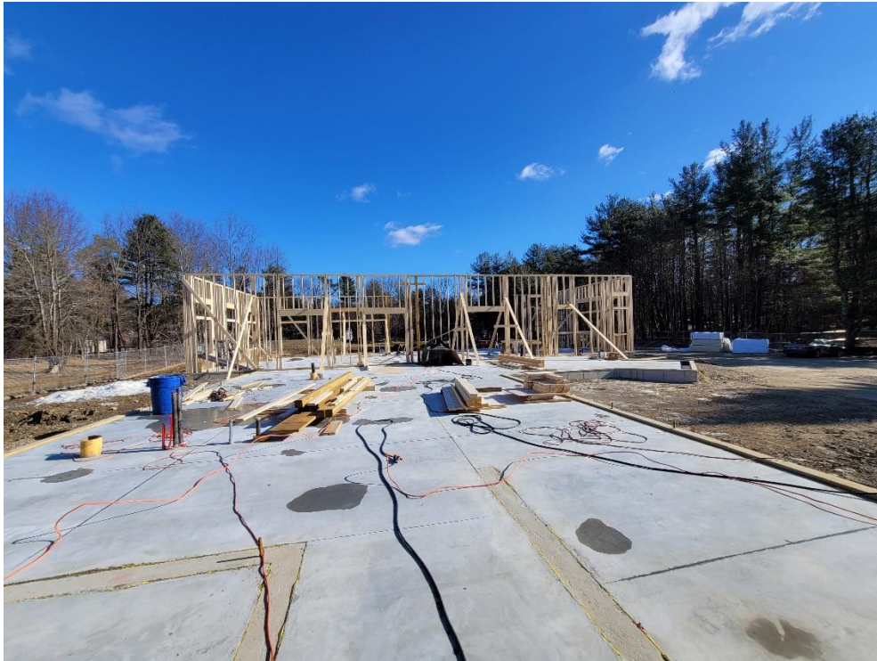
1. View of new Office Wing Slab from Cummings House