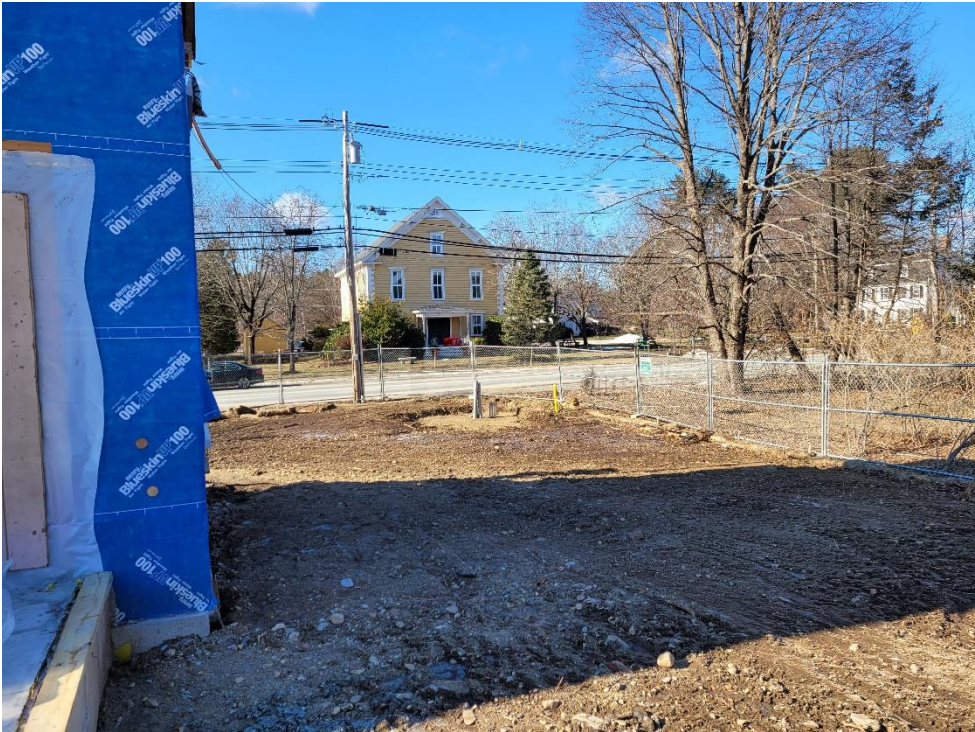
5. Duct bank for new electrical and communications services has been backfilled