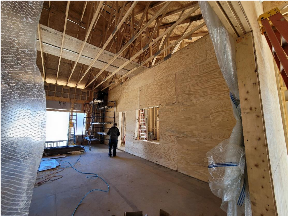
5. Sheathing on shear wall at Kitchen