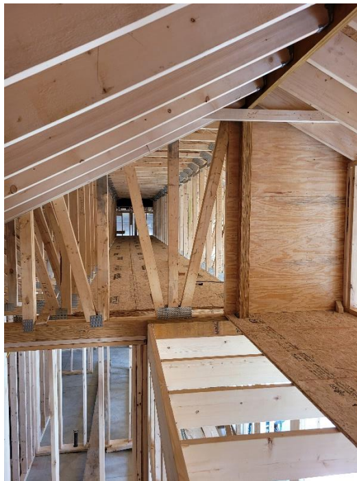
10. End truss (GEO-1) at beginning of stick framed roof; partially sheathed; angled web member to be removed for access to catwalk