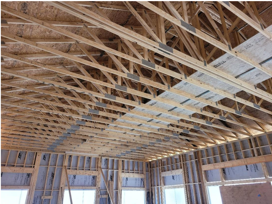
6. Catwalk along length of Multipurpose Room