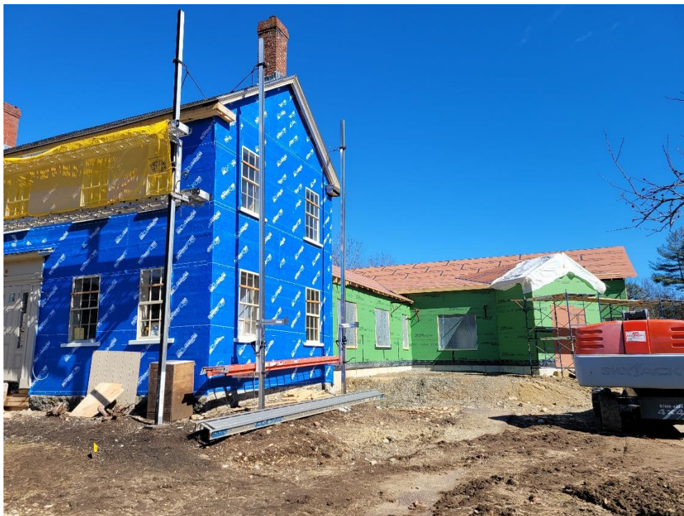
1. Progress view from southwest