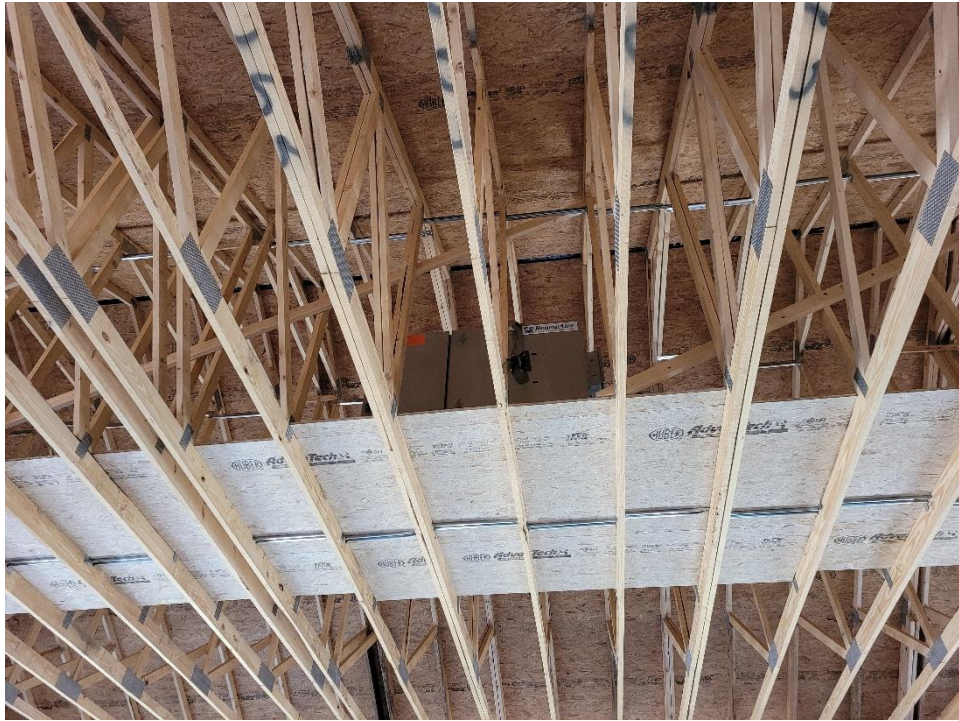
7. ERV unit in place on catwalk above Multipurpose Room