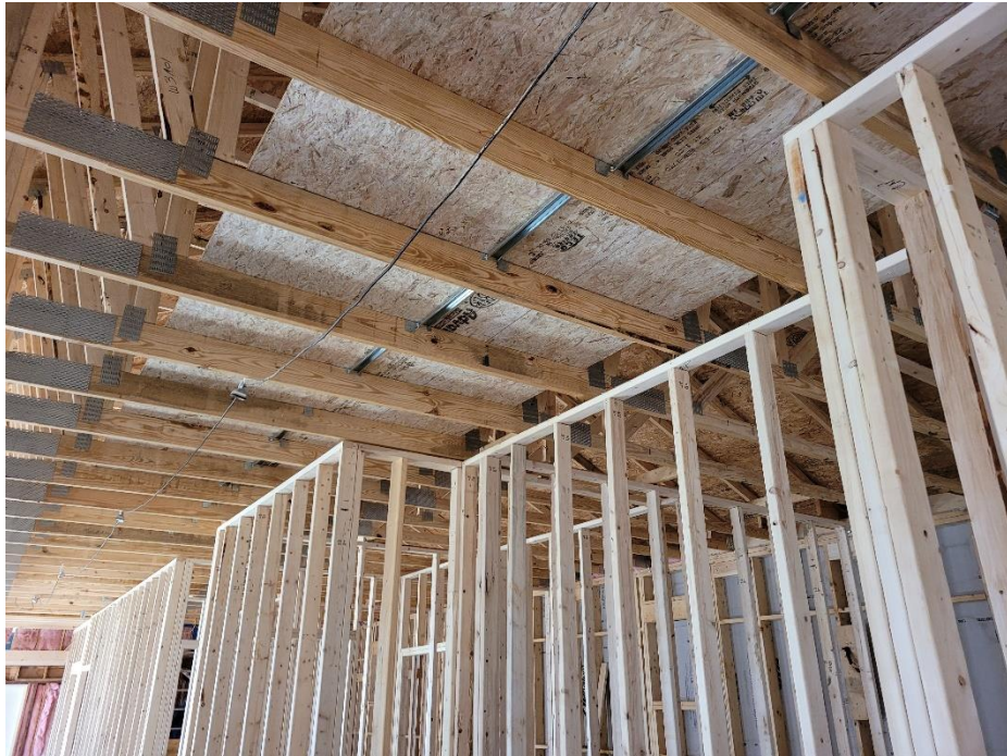
9. North end of Lobby at Coat Closet