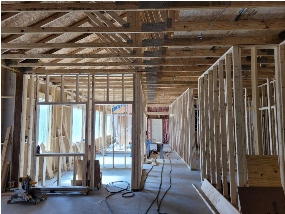
8. View down hallway toward Cummings House at far end