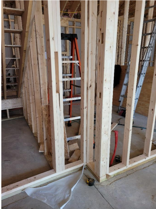
11. Recess at drinking fountain