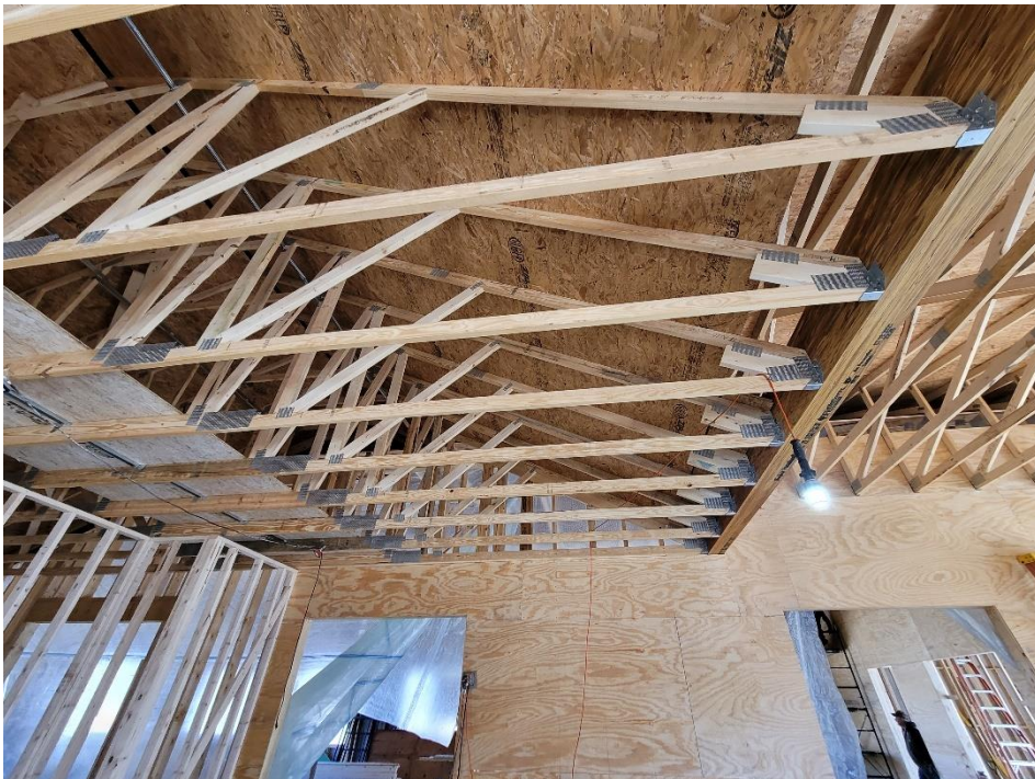
4. Trusses over east end of Office Wing (dropped beam at right)