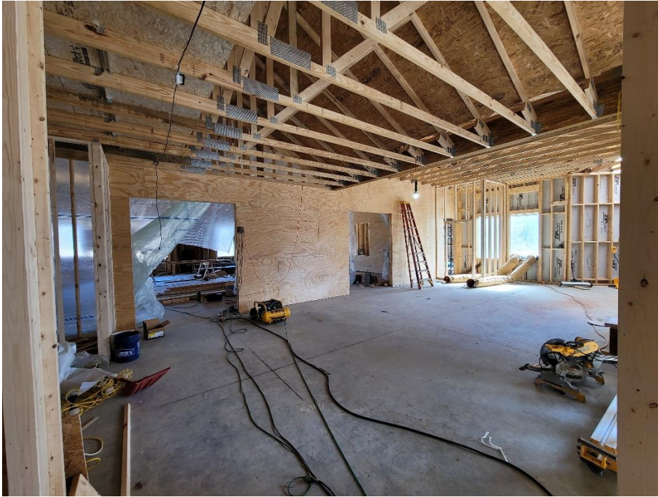
3. Main Lobby with sheathing on shear wall at Multipurpose Room